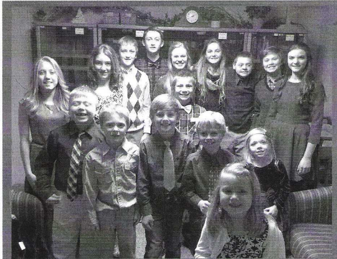
The Sunday School kids did a great job sharing Luther's Rose & God's Love at Christmas!